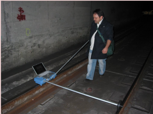
The CAT in use. An industry-standard notebook PC is used for data acquisition and analysis

The CAT is an extremely accurate instrument that can be used to measure rail for acoustics purposes and for Quality Assurance of rail grinding. It has the great attraction that it can be both used and carried by a single person: the equipment, when packed in a convenient box (supplied), weighs less than 15kg. There are few, if any, instruments that can measure extended sections of rail with similar accuracy and no others, to our knowledge, which can be used conveniently by a single person.